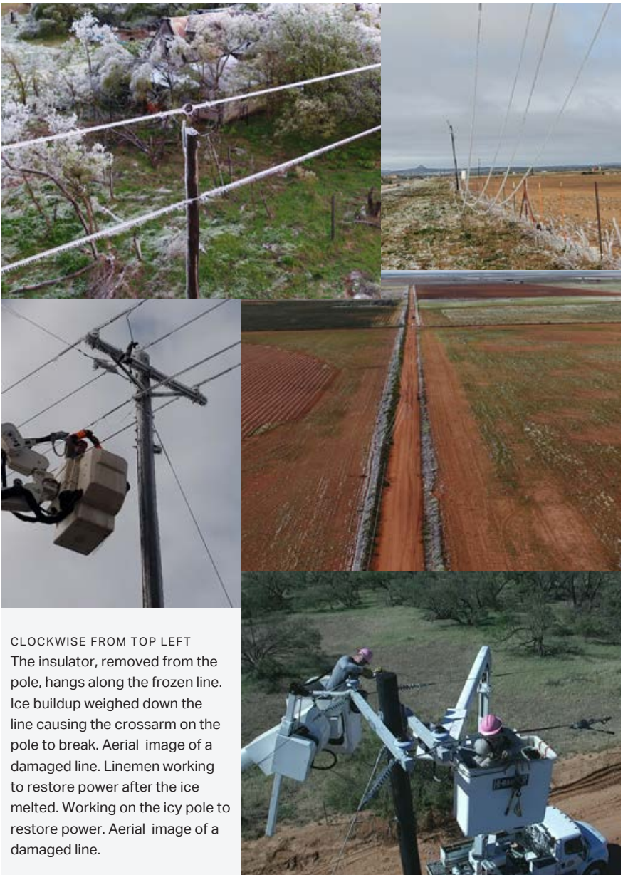
CLOCKWISE FROM TOP LEFT The insulator, removed from the pole, hangs along the frozen line. Ice buildup weighed down the line causing the crossarm on the pole to break. Aerial image of a damaged line. Linemen working to restore power after the ice melted. Working on the icy pole to restore power. Aerial image of a damaged line.

TEXAS WEATHER IS UNPREDICTABLE. On October 26, a cold front brought low temperatures and rain to much of west and north central Texas. This weather hit our Seymour and Munday service territories hard. Damage included downed lines and numerous broken poles and crossarms. On the first night, crews were able to restore power to more than 1,000 members before another round of weather set in on October 27, causing even more damage. One of the major challenges was ice on the transmission lines feeding the area. Tri-County Electric Co-op crews worked closely with the area transmission providers to restore power. Crews from our Azle, Granbury and Keller service territories helped with restoration efforts. Linemen worked around the clock until every member was restored on the evening of Friday, October 30. 19030002 Tri-County Electric Co-op is prepared for another ice storm or whatever winter may bring this year. We are here for you. ■