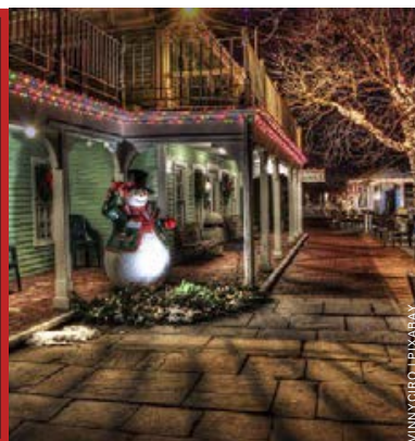
RADIANCE! at the Ranch Nov 11 - Jan 3