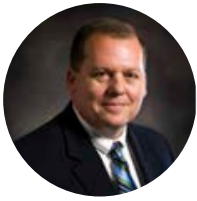
MESSAGE FROM PRESIDENT/ CEO